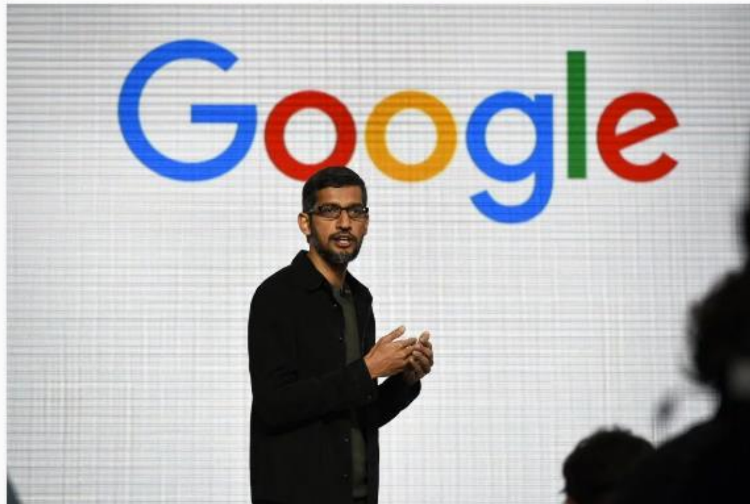
Sundar Pichai, chief executive officer of Google.

What My Dad Taught Me About Dealing With Men at Work