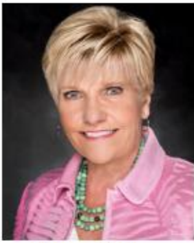
Betsy Price (Mayor)