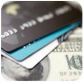
Pay a fine