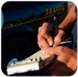
Traffic & General Citations