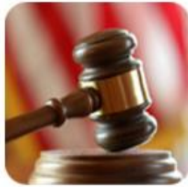
Rules of the Court